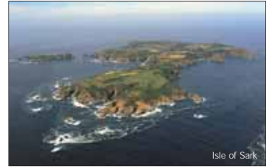
Isle of Sark